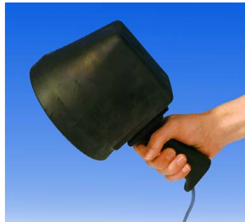
Excellent overall balance