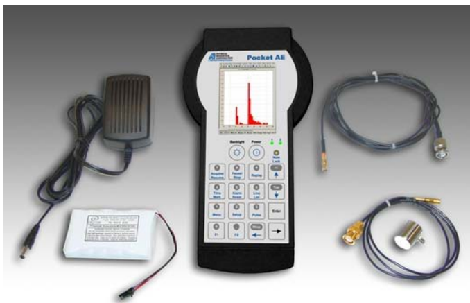
The Pocket AE-1 System comes with hand-held, single-channel AE unit, R15 (AE sensor, 1 meter sensor cable, 2 meter parametric cable with BNC connector and a battery eliminator DC power supply (case not shown).

The Pocket AE-1 comes complete with the hand-held, single-channel AE unit, an R15 \alpha (alpha) passive AE sensor, 1 meter sensor cable, 2 meter parametric cable with BNC connector, and a battery eliminator DC power supply, all inside a foam lined plastic carrying case with user documentation. Optionally, an external battery charger, an extra battery pack, compact flash cards and AWin™ Replay Software for desktop or notebook based analysis are available at an additional cost.